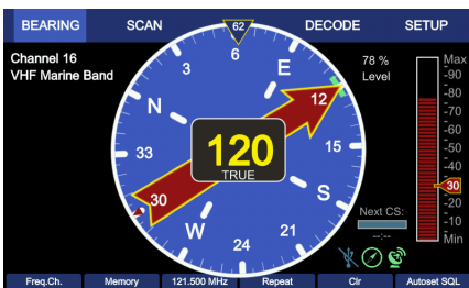
Standard bearing display shows bearing (true/magnetic or relative); signal level strength; working frequency or channel; heading status