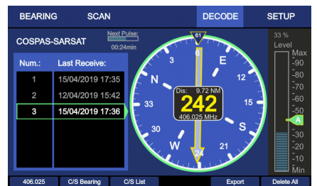
Decode page with direction and distance indication to COSPAS-SARSAT GPS-Position and list of reception history