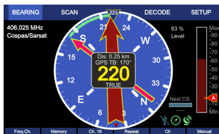
When MOB function is activated, the pink indicator shows the direction to the MOB position. The distance is indicated in the window.