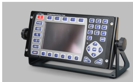
DCU Mounting Kit