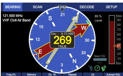
Standard bearing display with additional COSPAS-SARSAT GPS-direction indicator (indications can be different)