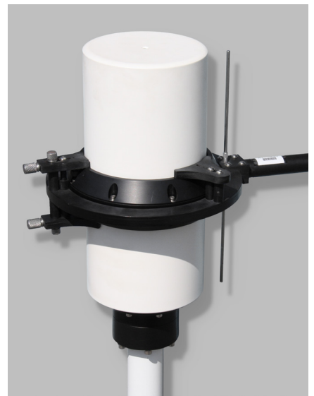
Antenna Measurement Device