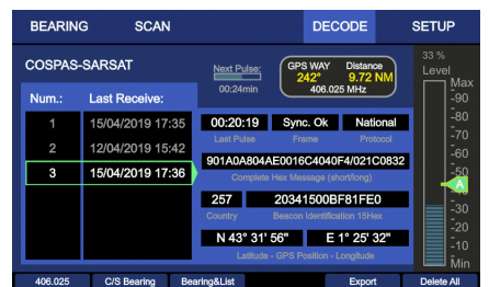
COSPAS-SARSAT decode page with list of all beacon information including indication to the GPS-Position (distance and direction)