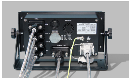
Waterproof D-Sub and LAN-connectors