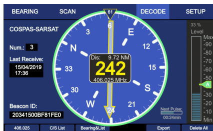
Decode page with direction and distance indication to COSPAS-SARSAT GPS-Position