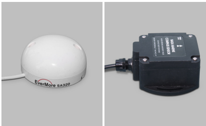
External GPS- and Compass Module